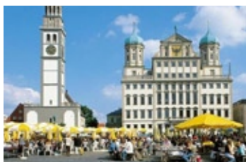
Augsburg | Marketplace and Town Hall