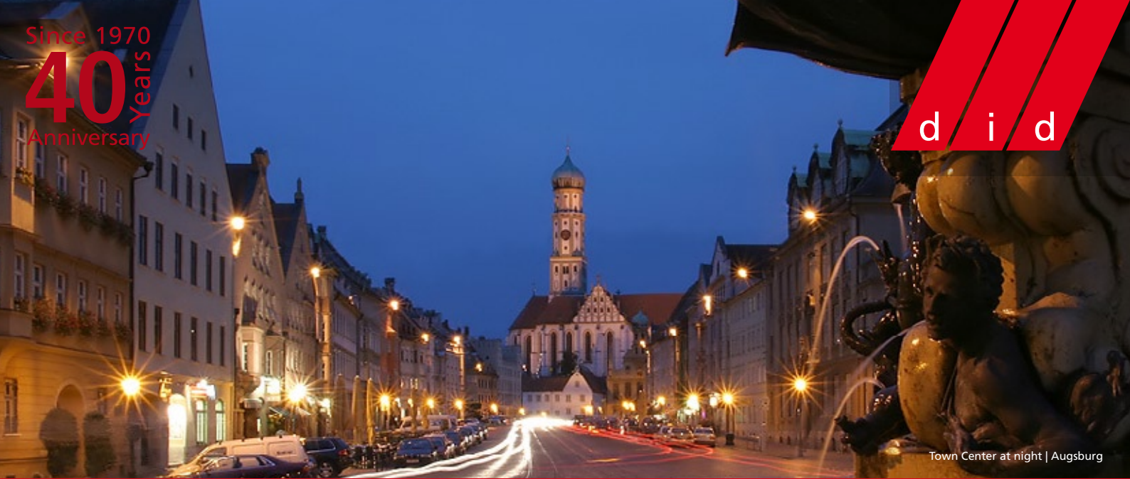
Town Center at night | Augsburg