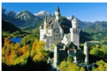
Excursion | Neuschwanstein castle