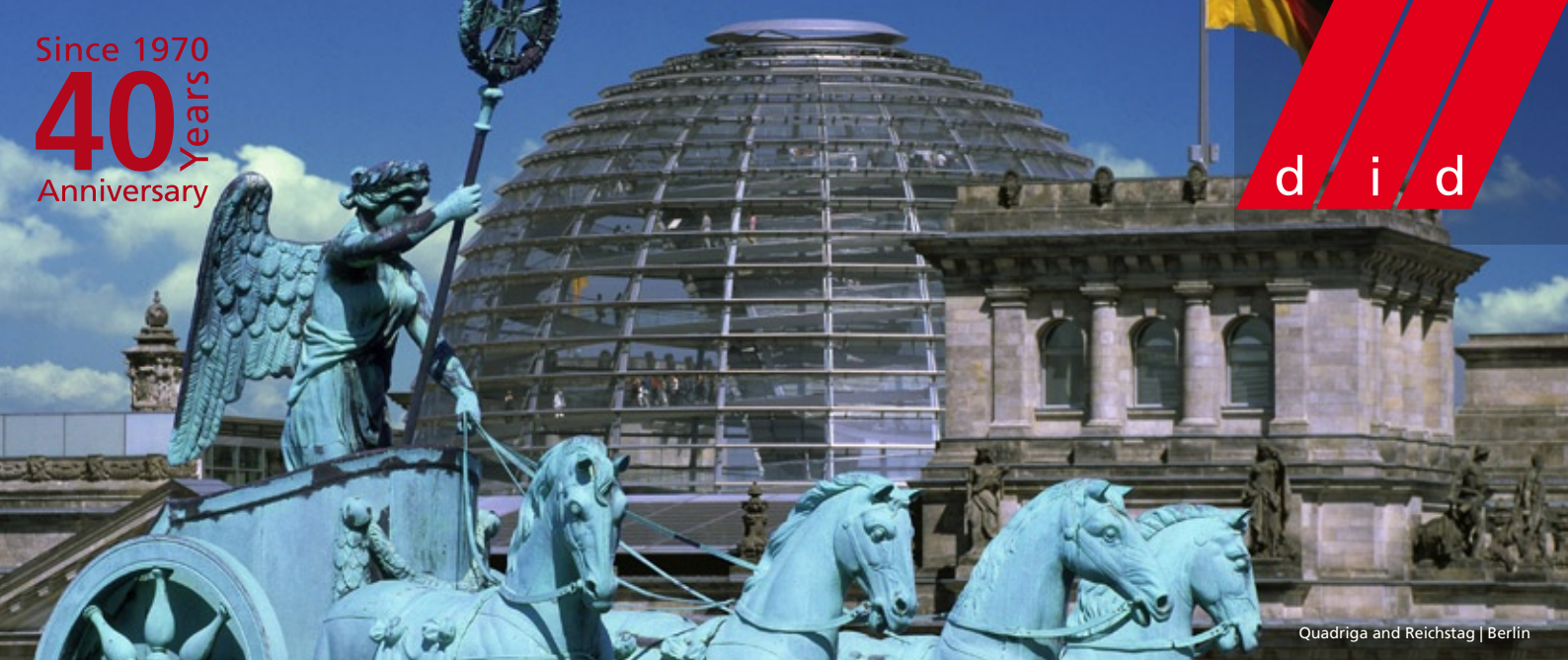
Quadriga and Reichstag | Berlin