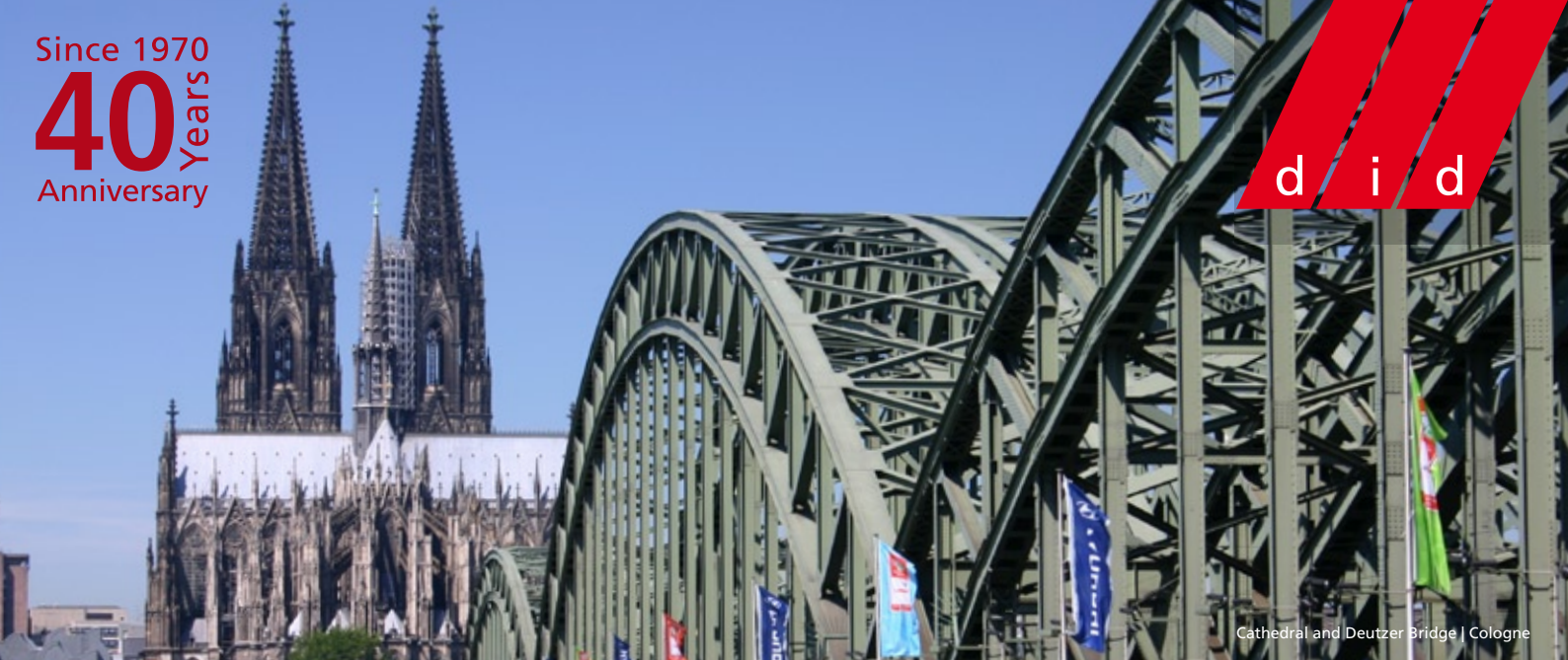
Cathedral and Deutzer Bridge | Cologne