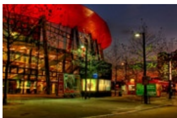
Cologne | Kölnarena venue